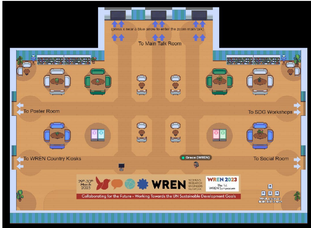
Figure 2: The WREN 2023 Symposium Lobby

The Lobby. This is the room for general networking and information. The Lobby acts as a hub to all other rooms in the Symposium